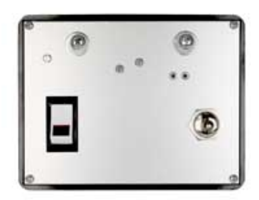
Step 1: Choose Your Controller Selected (image at left)

Step 2: Choose Your Wheel Now that you have identified your current controller, please click on the Brent Wheel Model that needs a replacement part from the list below: