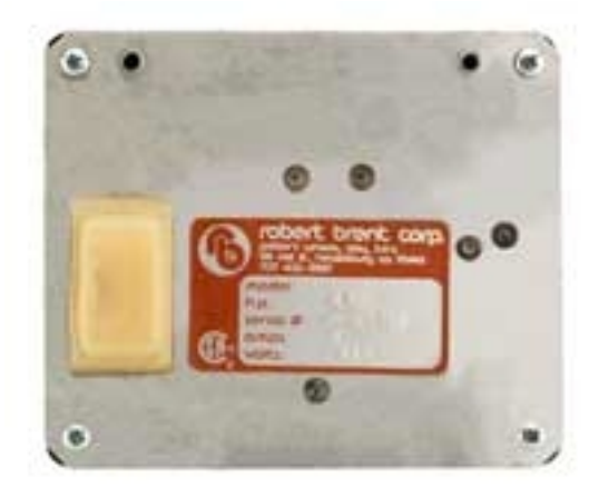
Step 1: Choose Your Controller Selected (image at left)

Step 2: Choose Your Wheel Now that you have identified your current controller, please click on the Brent Wheel Model that needs a replacement part from the list below: